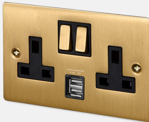
2G UK USB CHARGER BRASS